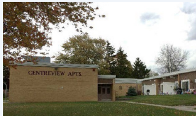
This guide is intended to provide preliminary information only. Last updated: December 29, 2022