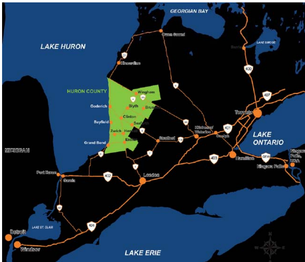
Huron County (The State of the Huron County Economy 2010)