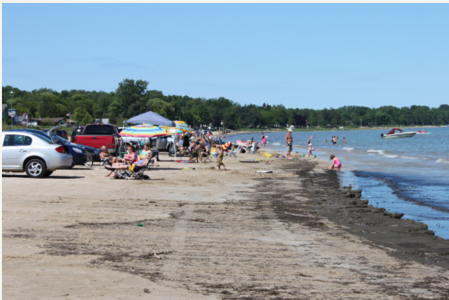
Enjoying Ipperwash Beach.

Once the information is collected, we will be developing recommendations. These will be shared with the community and will form the basis for efforts to seek funds to help address water quality and aesthetic issues along the Lambton Shores beaches.