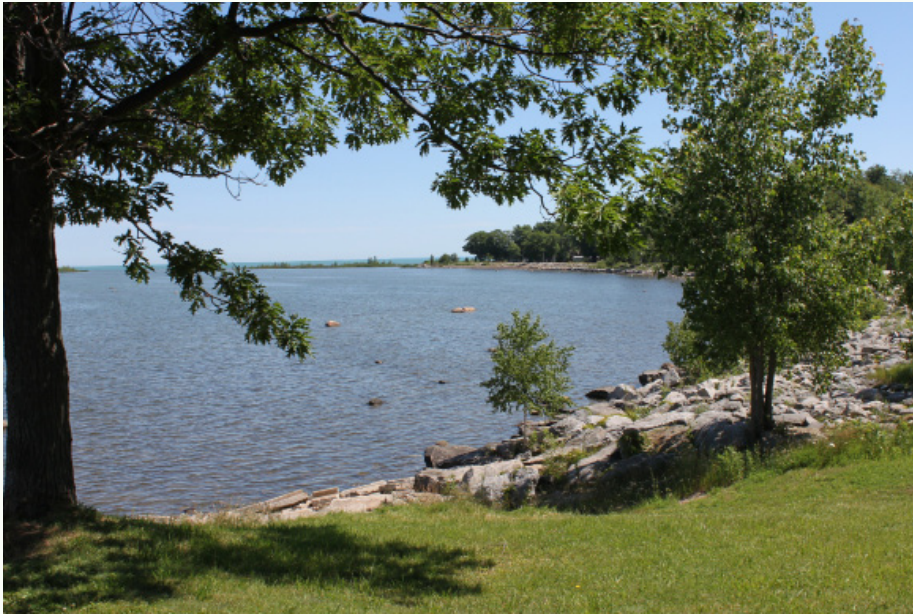
The Lake Huron shoreline near Kettle Point.

The Ausable Bayfield Maitland Valley and the Thames-Sydenham and Region Drinking Water Source Protection Committees have worked cooperatively with