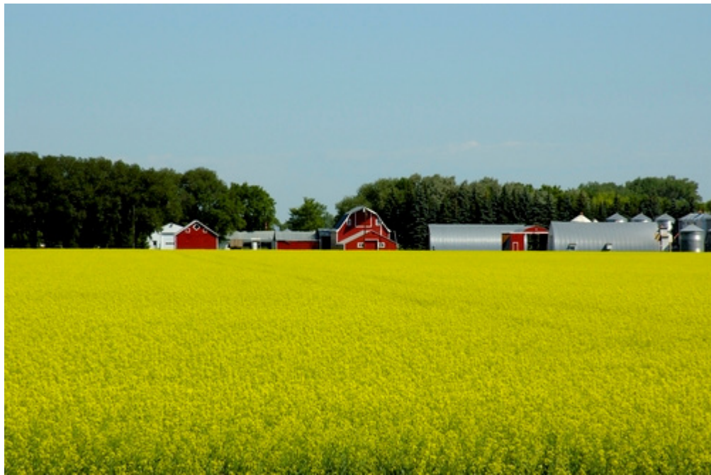
Farmers are a significant part of the Lake Huron community, and are helping to improve water quality by implementing Environmental Farm Plans.

By participating in the Environmental Farm Plan Program, farmers see their farms in a new light. The program helps them to both identify environmental problems in their operations and develop plans for improving their farms' environmental footprint in the future. Farmers in the counties near the Lake Huron shores are strongly committed to managing their land in a healthy and sustainable way for the future.